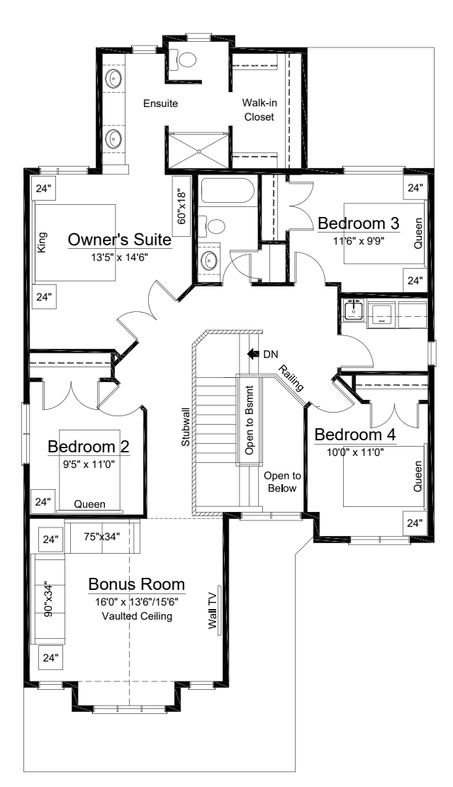
1,391 sq ft